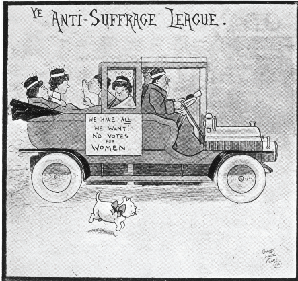
A British cartoon, 1908.